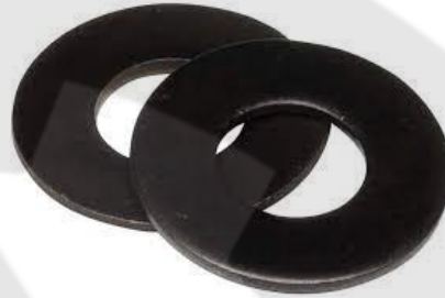
DIN 125 Washers

Send your Orders / Enquiries along with the following Item Codes